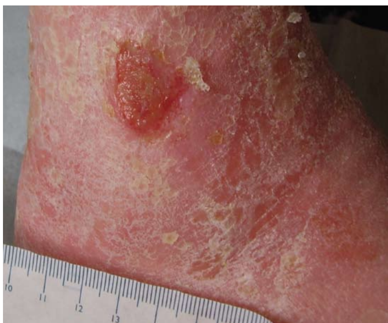
Photograph 3: Prior to Kendall™ AMD antimicrobial foam dressing

Initially the Kendall AMD antimicrobial foam dressing was used as a bacterial barrier while the wound was investigated. It continued to be applied to the ulcer on a weekly basis, until at the end of the evaluation period the wound was observed to have healed. Photograph 4 shows the wound after two weeks treatment with the evaluation dressing.