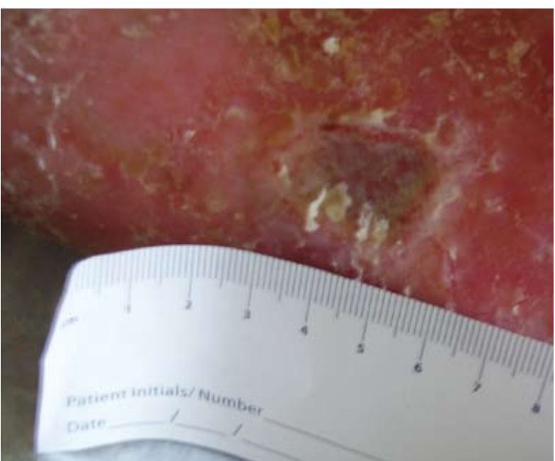
Photograph 4: After two weeks with the Kendall™ AMD antimicrobial foam dressing