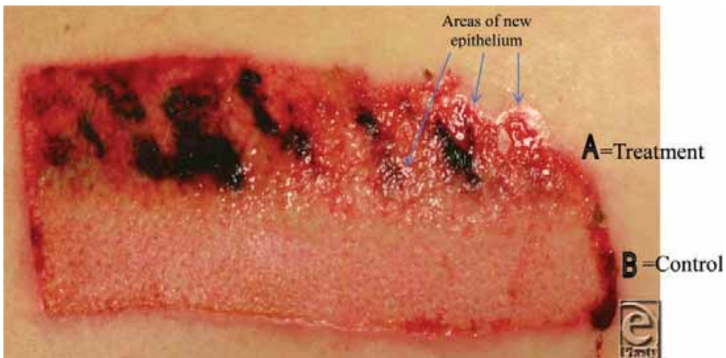
Figure 2. Photograph showing epithelialization of a typical donor site 7 days after surgery.